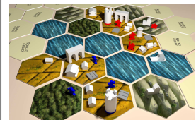
Szene of Romolo o Remo